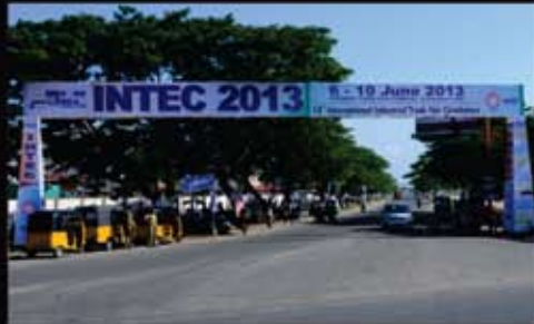
Entrance Arch at Codissia Trade Fair Complex