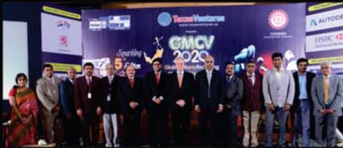
GMCV 2020 ORGANISERS and SPEAKERS