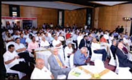
Delegates at GMCV 2020