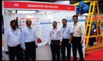
Stall at INTEC 2013