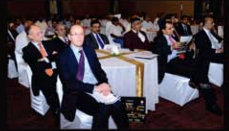
Delegates at GMCV 2020