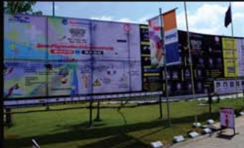
Hoardings at Codissia Trade Fair Complex