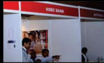
Stall at GMCV 2020 Venue