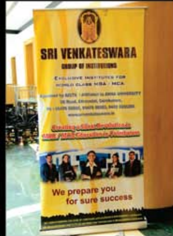
Standby at GMCV 2020 Venue