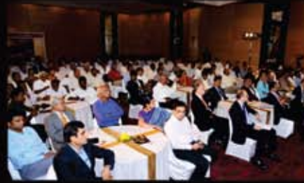
Delegates at GMCV 2020