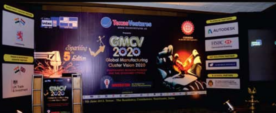
Main Stage Back Drop