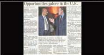
News Coverage in THE HINDU on 08.06.2013