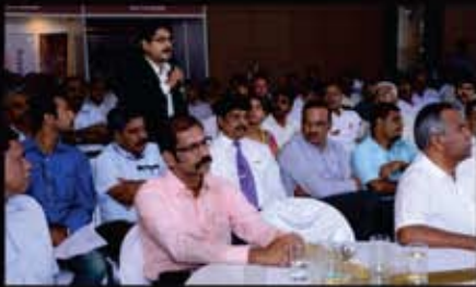
Delegates Interacting with Panelists