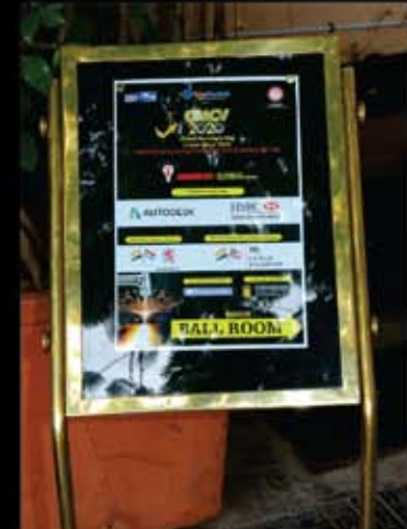
Navigation Board with Sponsors Logo