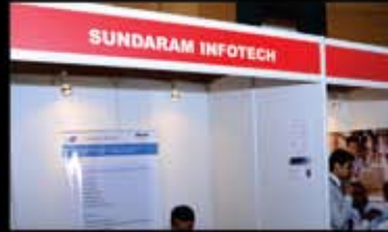
Stall at GMCV 2020 Venue