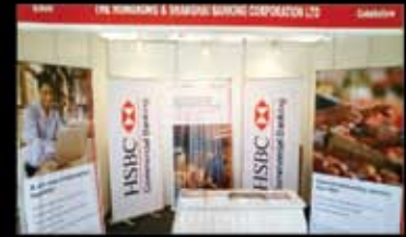
Stall at INTEC 2013