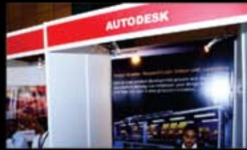
Stall at GMCV 2020 Venue