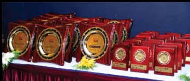
Memento for Speakers, Panelists and Supporting Associations