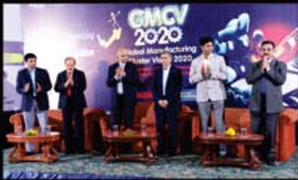
Panel Discussion : "SECOND GENERATION ENTREPRENEURSHIP IS A BOON OR A BANE"