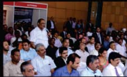
Delegates Interacting with Panelists