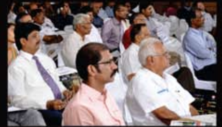
Delegates at GMCV 2020