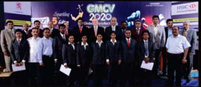
Students of Sri Venkateswara Group of Institutions with GMCV 2020 Organisers and Speakers