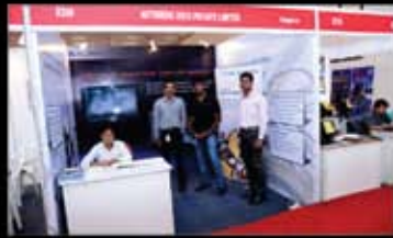
Stall at INTEC 2013