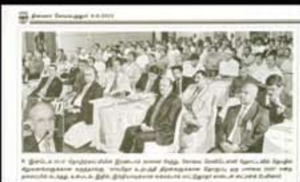
News Coverage in THE HINDU on 08.06.2013