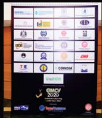
Supporting Association Banner