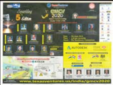
Half page Advertisement in THE HINDU on 06.06.2013