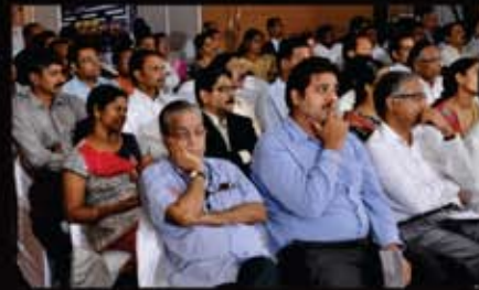
Delegates at GMCV 2020