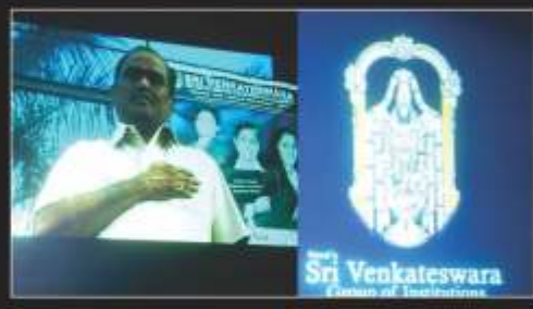
B-School Partner - Visual Interlude