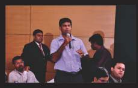
Delegates Interacting with Panelists