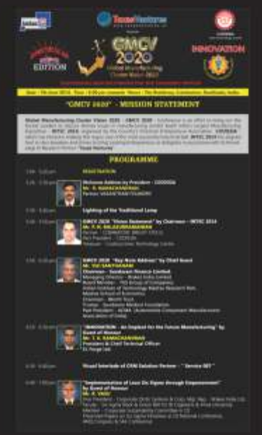
EDM - Electronic Direct Mailer