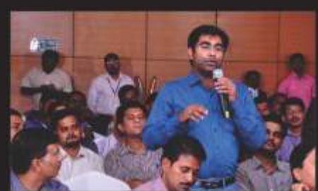
Delegates Interacting with Panelists.