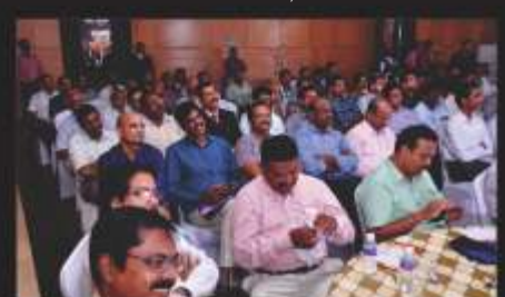
Delegates at GMCV 2020