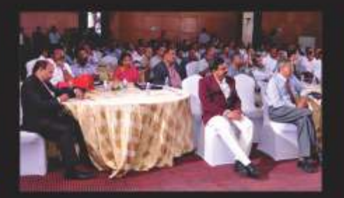
Delegates at GMCV 2020