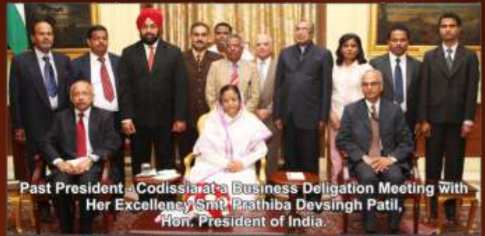
Past President - Codissia at a Business Delegation Meeting With Her Excellency Smt. Prathiba Devsingh Patil, Hon. President of India.