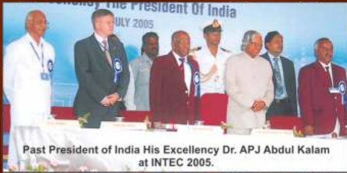
Past President of India His Excellency Dr. APJ Abdul Kalam at INTEC 2005.