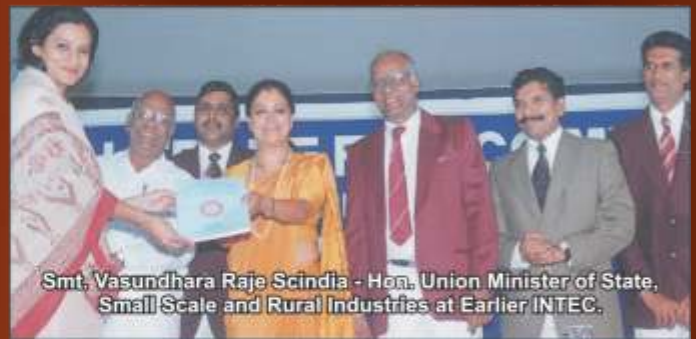
Smt. Vasundhara Raje Scindia - Hon. Union Minister of State, Small Scale and Rural Industries at Earlier INTEC.