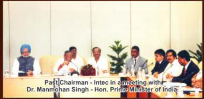
Past Chairman - Intec in a meeting with Dr. Manmohan Singh - Hon. Prime Minister of India.