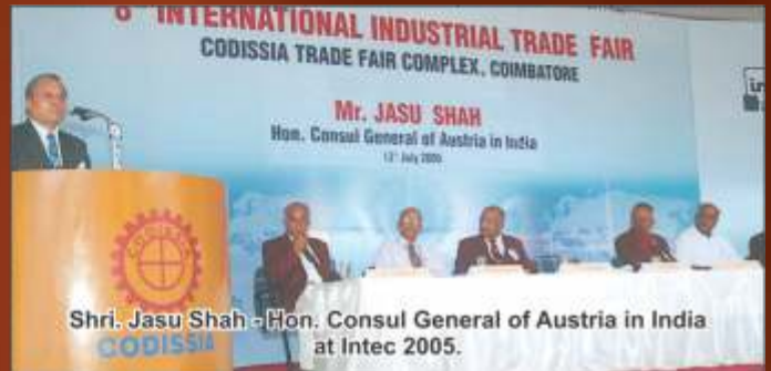
Shri. Jasu Shah - Hon. Consul General of Austria in India at Intec 2005.