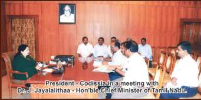
President - Codissia in a meeting with Dr. J. Jayalalithaa - Hon'ble Chief Minister of Tamil Nadu.