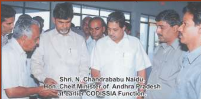
Shri. N. Chandrababu Naidu, Hon. Chief Minister of Andhra Pradesh at earlier CODISSIA Function.