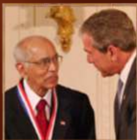
Prof. Dr. C. RADHAKRISHNA RAO Recipient of Padma Vibushan, Fellow of Royal Society of London (FRS), Head - Pennsylvania State University, USA. Scientific Advisor in Risk Analysis to US Government.