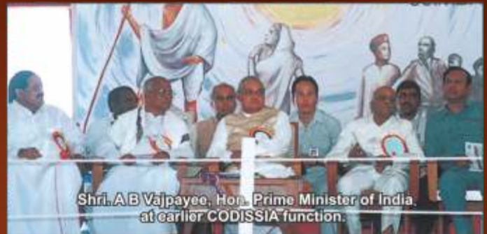
Shri. A.B. Vajpayee, Hon. Prime Minister of India at earlier CODISSIA function.