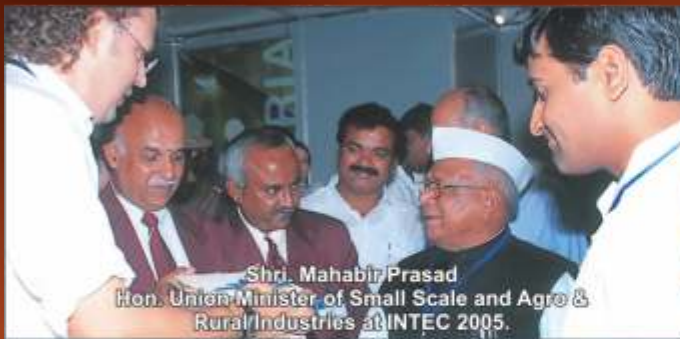
Shri. Mahabir Prasad Hon. Union Minister of Small Scale and Agro & Rural Industries at INTEC 2005.