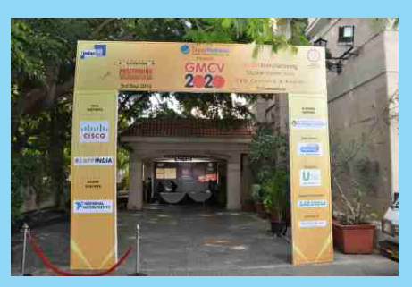
Arch at the Entrance of the Conference Venue