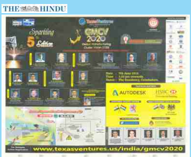
Half page Advertisement in The Hindu.