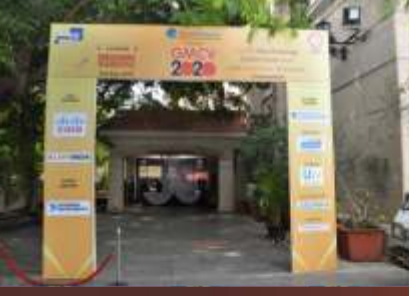
Arch at the Entrance of the Conference Venue