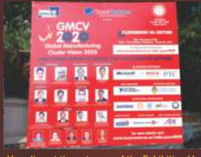
Hoarding at the entrance of the Exhibition Venue