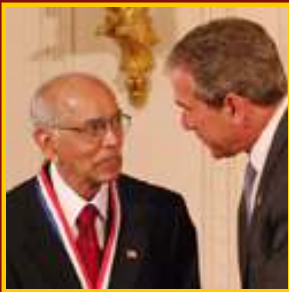
Prof. Dr. C. RADHAKRISHNA RAO Recipient of Padma Vibushan, Fellow of Royal Society of London (FRS), Head - Pennsylvania State University, USA. Scientific Advisor in Risk Analysis to US Government.