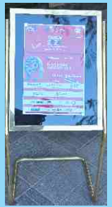
Standing Display Board