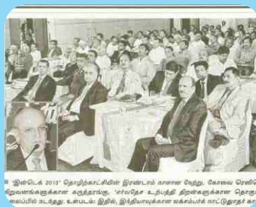
Event Coverage in News Papers.