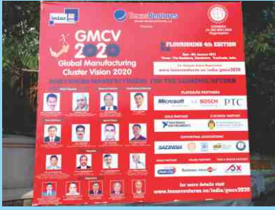
Hoarding at the entrance of the Exhibition Venue