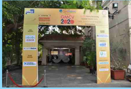
Arch at the Entrance of the Conference Venue