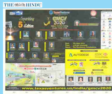
Half page Advertisement in The Hindu.