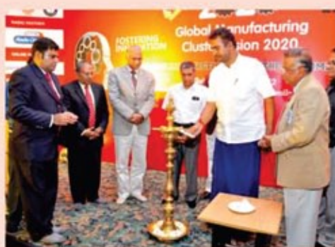
Lighting of Lamp by Hon. Minister Thiru. S. P. VELUMANI