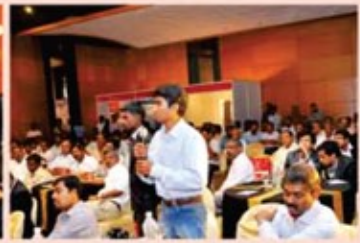
Delegates Interacting with Panelists