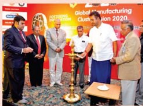
Lighting of Lamp by Hon. Minister Thiru. S. P. VELUMANI