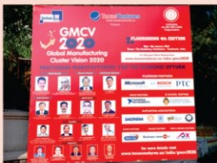
Hoarding at the Entrance of The Hotel Residency