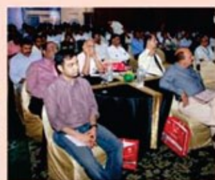
Delegates at GMCV 2020