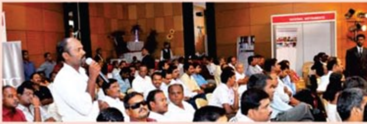
Delegates Interacting with Panelists