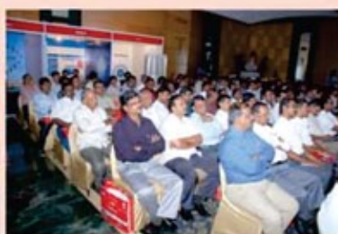
Delegates at GMCV 2020