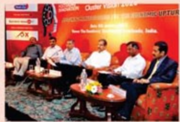
Panel Discussion - "Indian Manufacturing Economy 2012 - A Rocky Ride or Smoother Sailing Ahead"