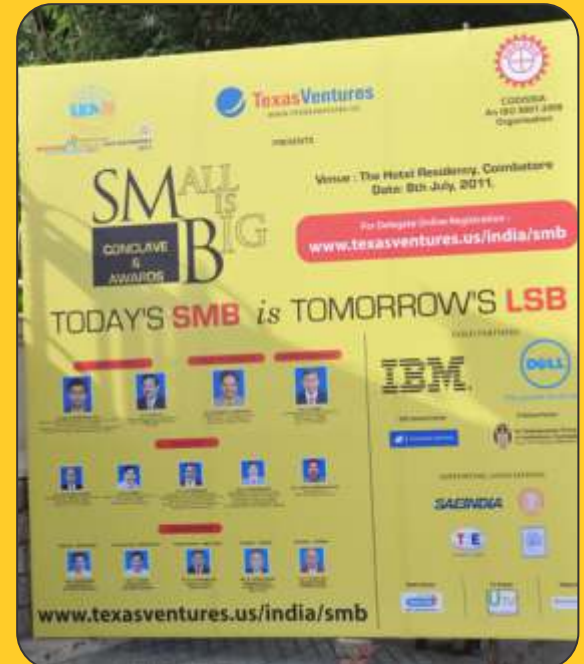
Hoarding at the entrance of the Exhibition Venue