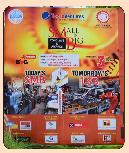
Hoarding at the Entrance of the Conference Venue