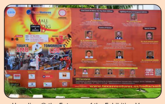
Hoarding @ the Entrance of the Exhibition Venue